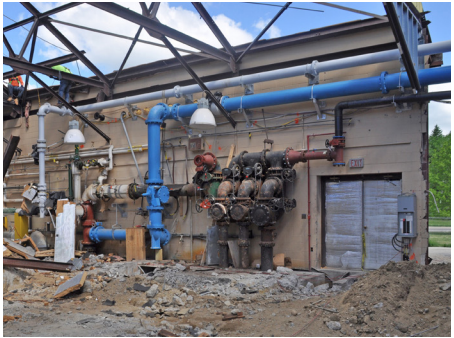
Partial Demolition of Original Structure