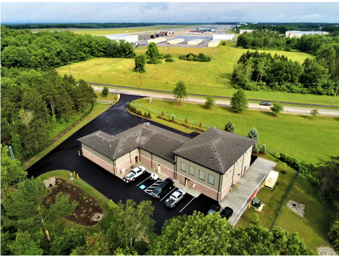
Aerial View of Completed Facility - Note Air Field in Background