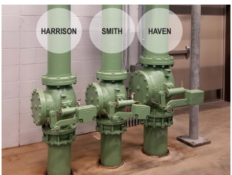
New Raw Water Manifold