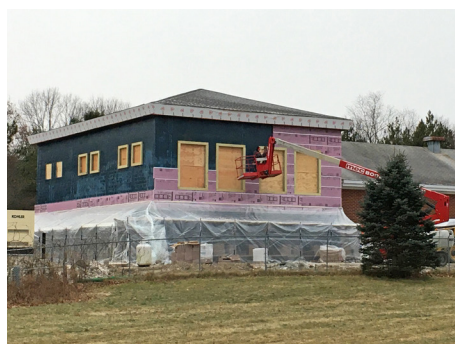
Construction of New Building Addition