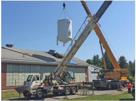
GAC Filters Installed in Original Structure as Part of Demonstration Project