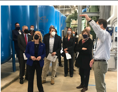
New Facility Commissioning Event