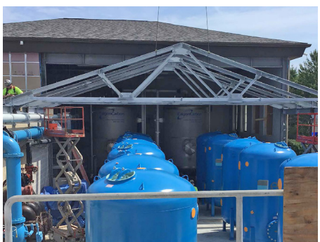
New Roof Installation Over Original Structure with Resin Filters in Place