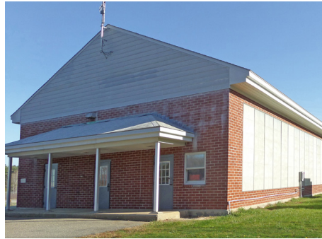
Original Treatment Plant