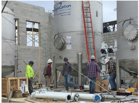
GAC Filtration System Installation