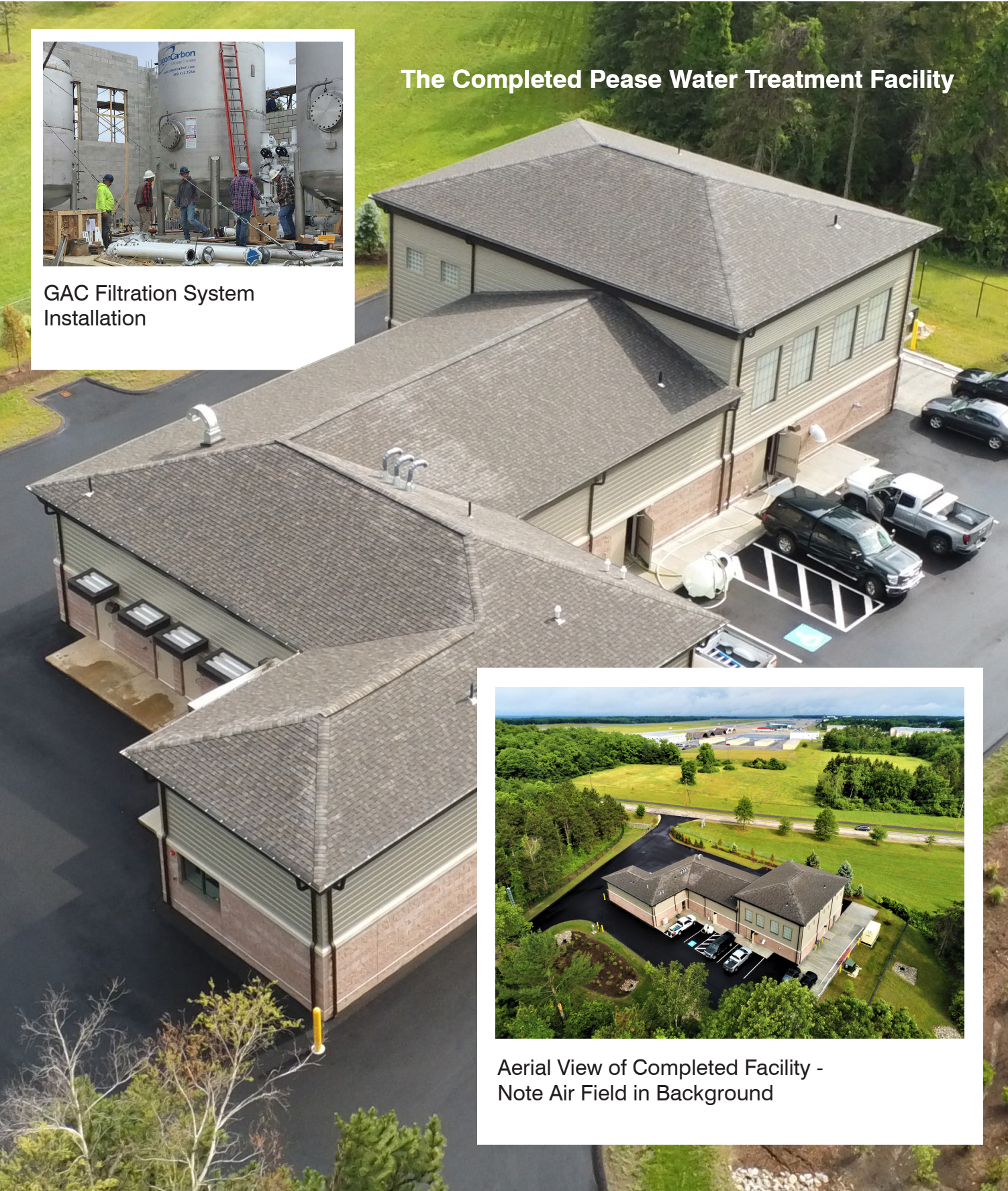
The Completed Pease Water Treatment Facility