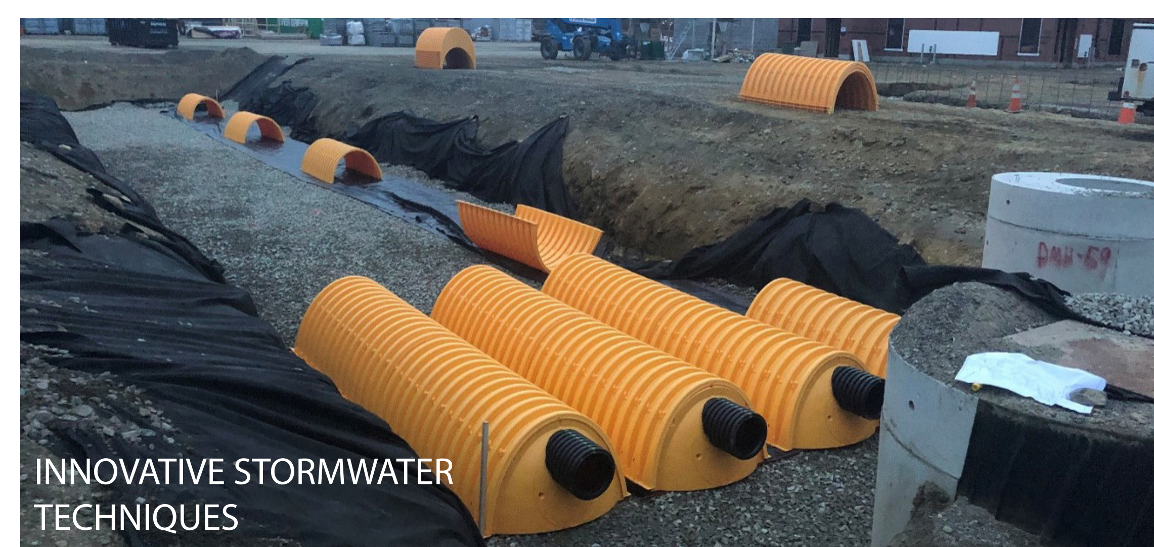
INNOVATIVE STORMWATER TECHNIQUES

ACEC NH 2023 ENGINEERING EXCELLENCE AWARDS