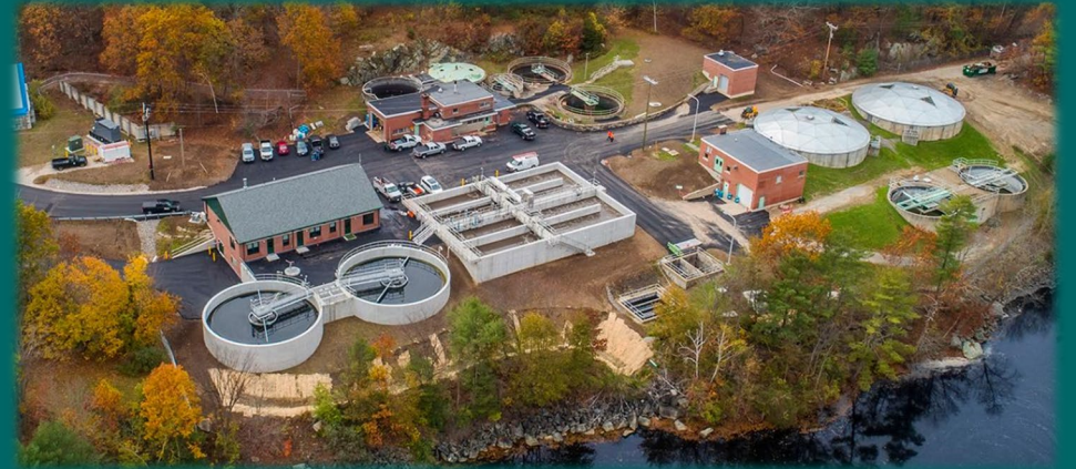
Wastewater Treatment Facilities (WWTFs)