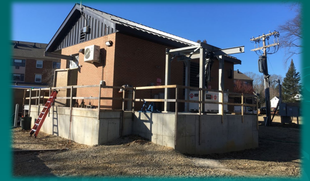
Pump Stations (PSs)