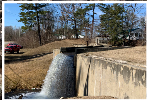
Previous 50-ft gravity weir